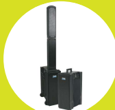
Portable Audio System