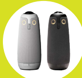
Smart 360° Video Camera w/ Mic & Speaker