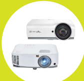
Laser, DLP Projector