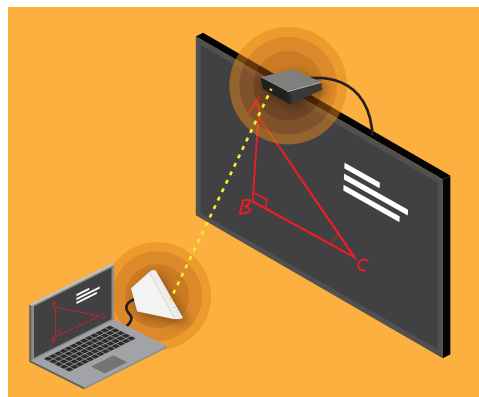
From Laptop to Large Display/Projector